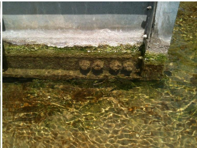
With HydroFLOW for 10 weeks