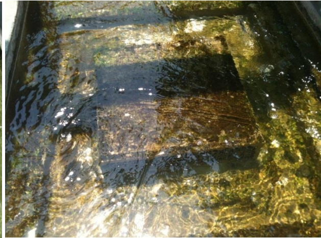
With HydroFLOW for 10 weeks